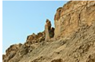
"Lot's Wife's" Pillar at Mt Sodom

Now these things happened as examples for us, so that we would not crave evil things as they also craved. 7 Do not be idolaters, as some of them were; as it is written, "THE PEOPLE SAT DOWN TO EAT AND DRINK, AND STOOD UP TO PLAY." 8 Nor let us act immorally, as some of them did, and twenty-three thousand fell in one day. 9 Nor let us try the Lord, as some of them did, and were destroyed by the serpents. 10 Nor grumble, as some of them did, and were destroyed by the destroyer. 11 Now these things happened to them as an example, and they were written for our instruction, upon whom the ends of the ages have come. 12 Therefore let him who thinks he stands take heed that he does not fall. (1 Cor 10:6-12)